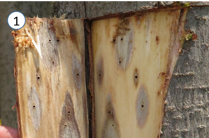
1. Cut and peel pieces of bark around entrance holes of the beetles.

Please provide as much detail as possible with samples: name of collector, date, location, tree species, etc.