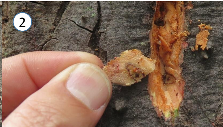
2. Cut or chisel out pieces of stained wood under the bark, around tunnels of the beetles.